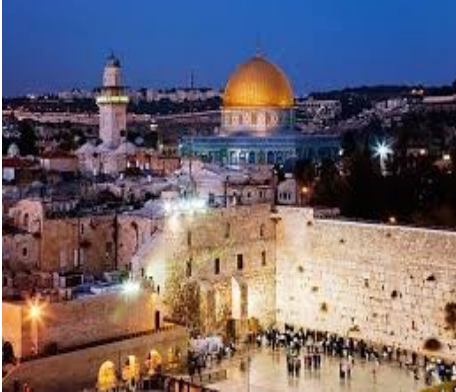
Temple Mt./Western Wall